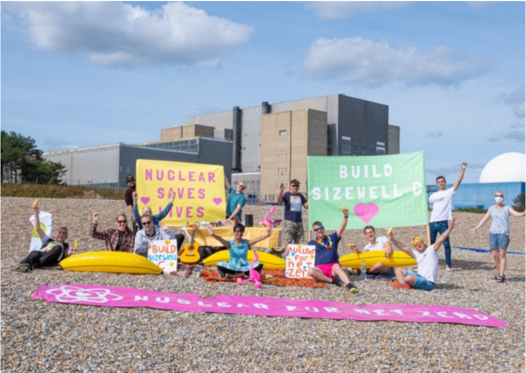
Protestors joined the Nuclear for Net Zero group for a beach party last Saturday in support of Sizewell C nuclear power plant.

Nuclear for Net Zero (N4NZ) was formed by climate activist Zion Lights and has now held two unusual protests in Suffolk using bananas as props to get their message across.