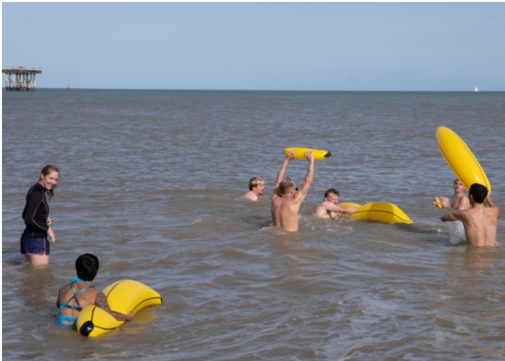
Protestors joined the Nuclear for Net Zero group for a beach party last Saturday in support of Sizewell C nuclear power plant.

The newly-formed N4NZ group held its first on September 1 in Ipswich and is demanding the government bring forward the UK's legally-binding net zero target from 2050 to 2035, as required by the climate emergency.