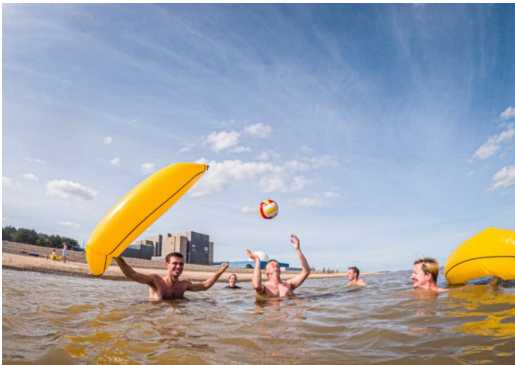
Protesters joined the Nuclear for Net Zero group for a beach party last Saturday in support of Sizewell C nuclear power plant.

The protesters played socially-distanced beach volleyball, shared food and displayed pro-nuclear banners on the beach.